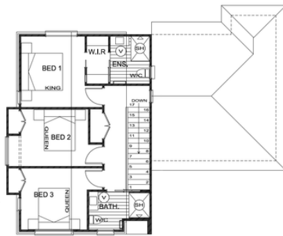
FLOOR PLAN L2 SCALE 1:100 AREA: 63.18m 2 OVER FRAMING AREA: 65.36m 2 OVER BRICK